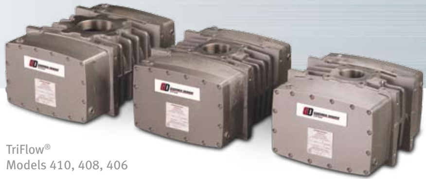
TriFlow® Models 410, 408, 406